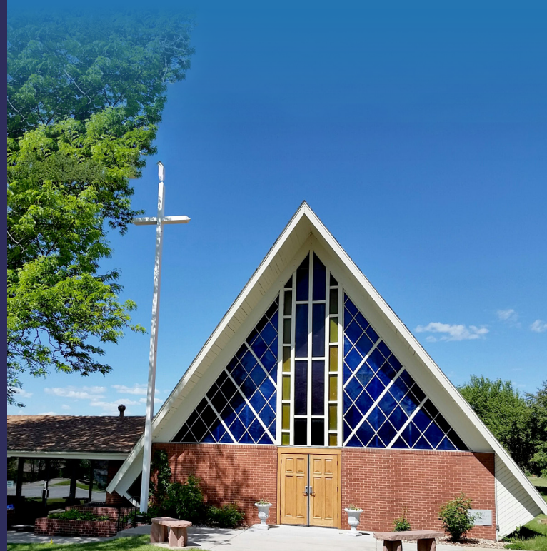
ADVENT LUTHERAN CHURCH

FULFILLING OUR MISSION SO ALL MAY KNOW CHRIST'S LOVE