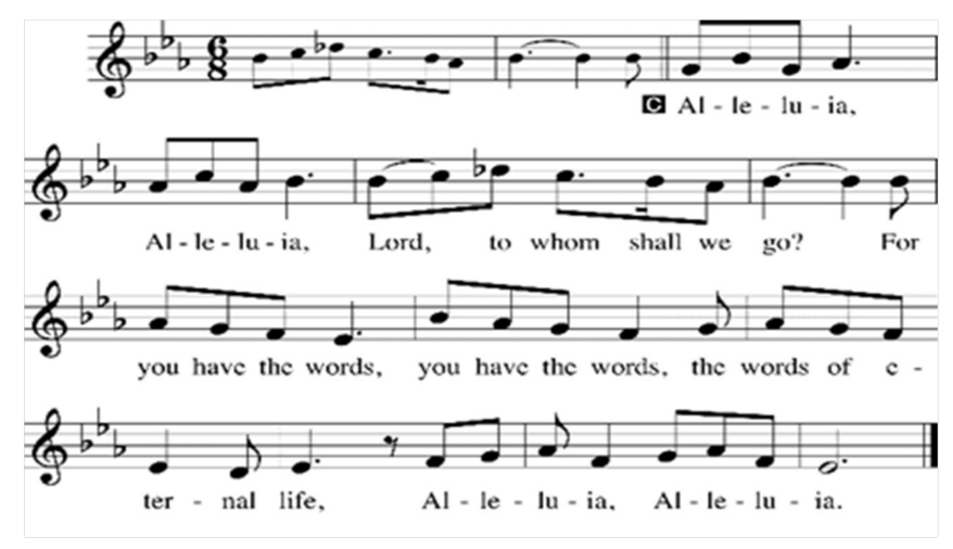
HOLY GOSPEL P: The Holy Gospel according to Luke 21:5-19 C: Glory to you, O Lord.